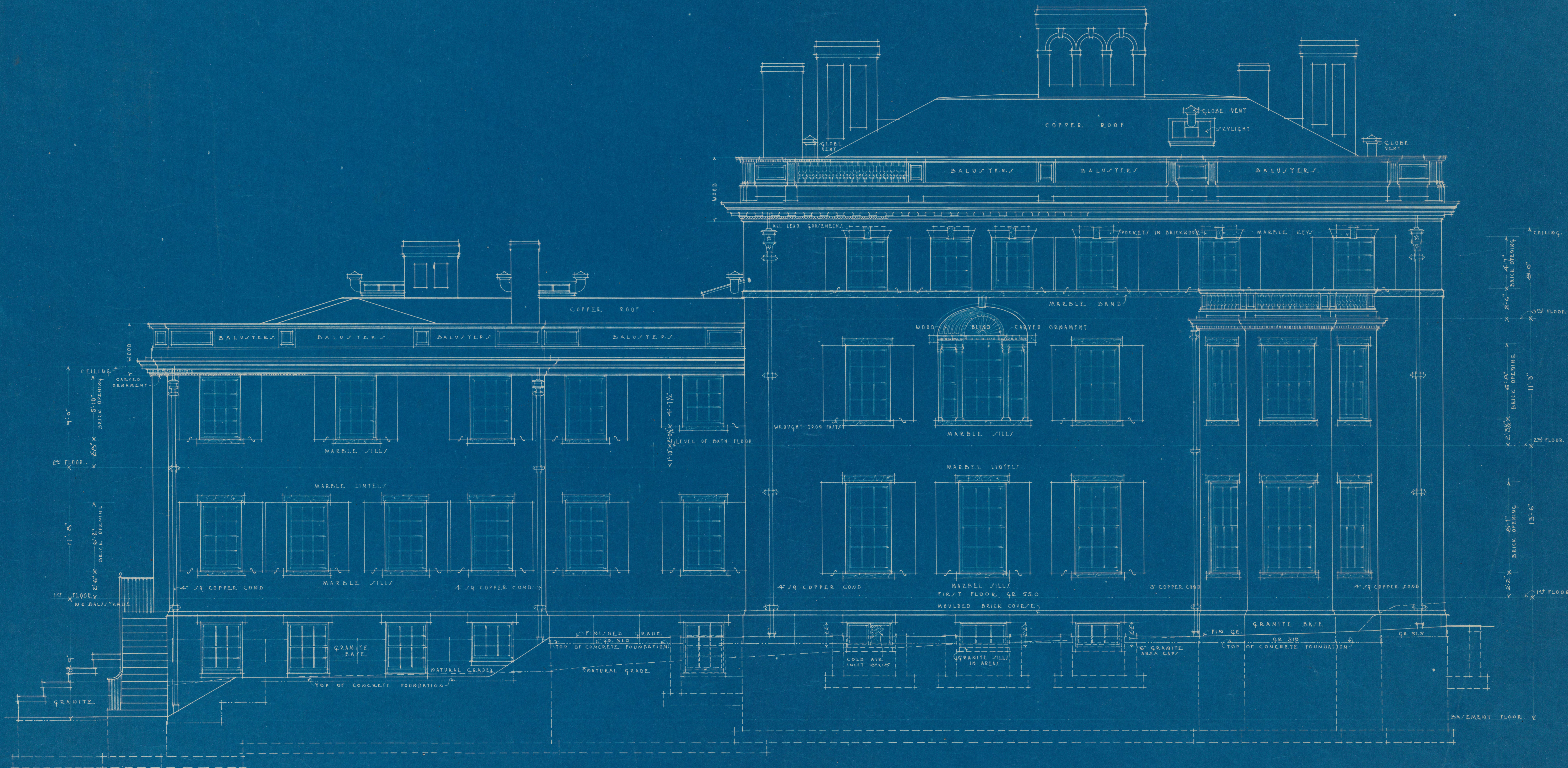
WEST ELEVATION SCALE 1/4" = 1'-0"