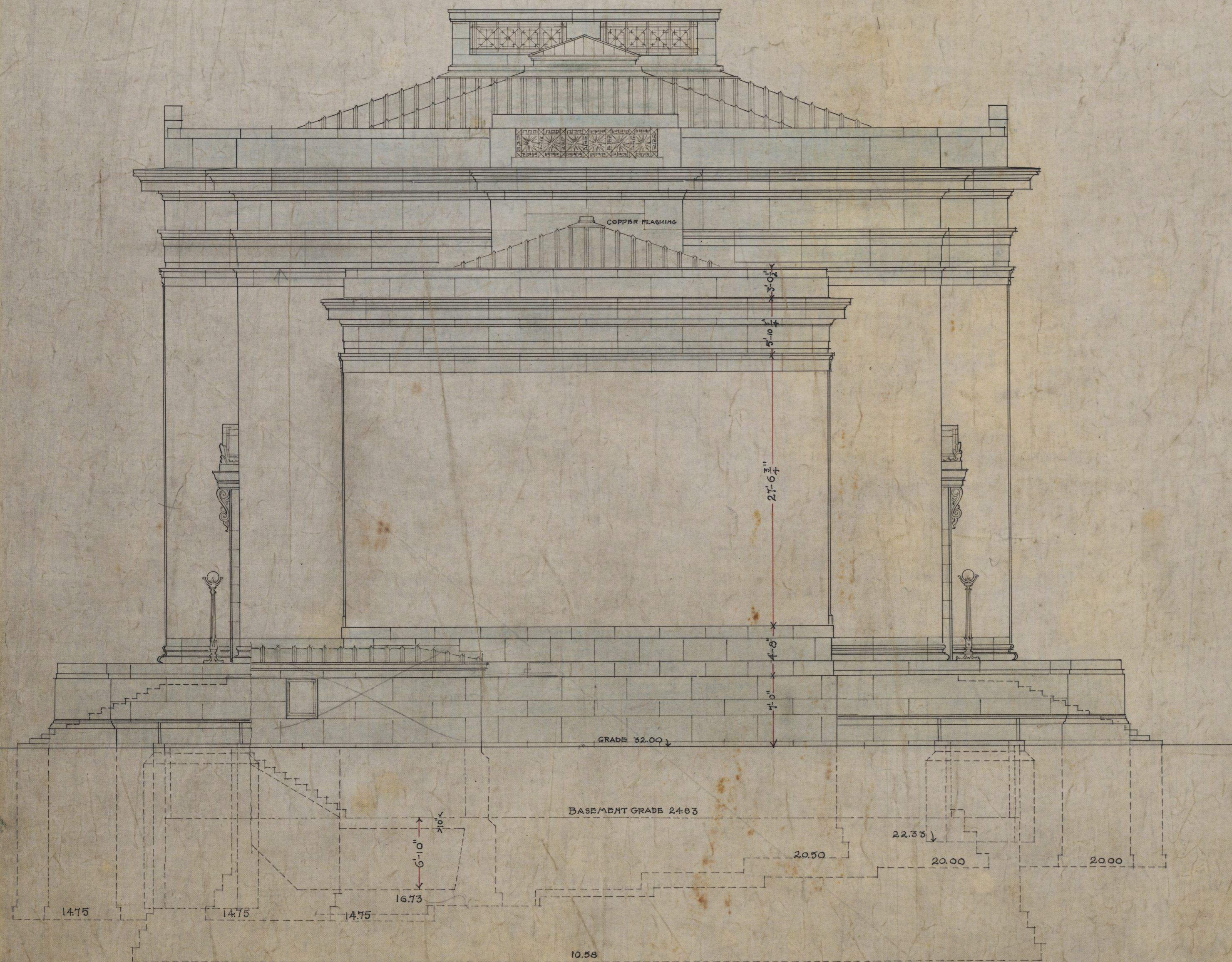
SOUTH ELEVATION SCALE \frac{1}{8}'' = 1'-0''